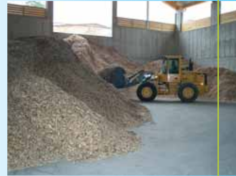
Chipwood storage area